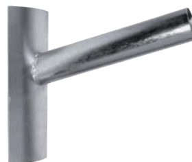
POLE MOUNTING ACCESSORIES