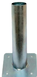
WALL MOUNTING ACCESSORIES